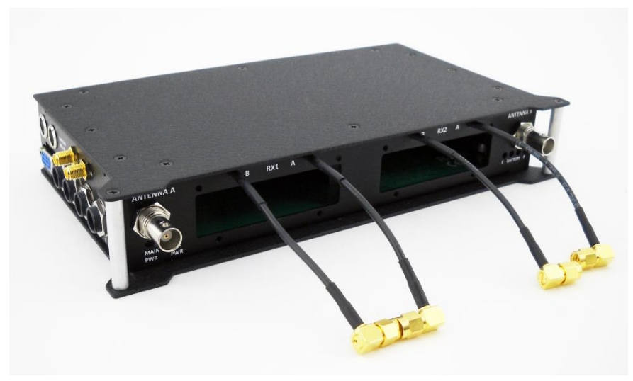
Frequency Ranges: "Single Band" 470Mhz to 700Mhz "Dual Band" 470-618Mhz and also Lectro Block 941 "Wide Band" 470Mhz to 960Mhz